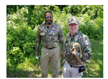
Volume 10, Issue 4 Dec 2022

A-ALL PEST TERMITE EXTERMINATORS, INC. 972-241-5223 AALLPEST@YAHOO.COM